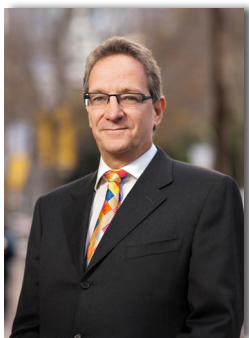
Managing Director and Licensee